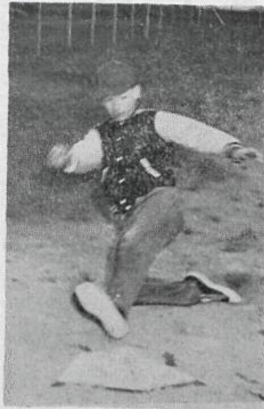
HIT THE DIRT—An unidentified little league player demonstrates sliding form in Saturday afternoon's practice session.